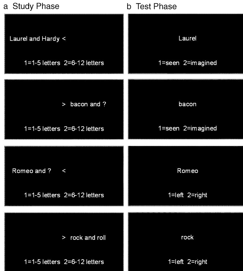
Fig. 1. Examples of the cues and stimuli used during the study and test phases. (a) In the study phase, participants studied either well-known word pairs or the first word of a word pair and a question mark, which were presented either on the left or right of a monitor screen. They were cued to view each word pair and either to look at, or to imagine, the second word of each pair and to count the number of letters it contained. (b) In the subsequent test phase, the first word of each studied word pair was again presented, and participants were cued to recollect either whether the second word in the word pair had been seen or imagined, or alternatively whether the word pair had been presented on the left or right of the screen.

word pair had been perceived or imagined in the study phase ('1 = seen, 2 = imagined'). Also included were 6 baseline trials that involved making a semantic living/nonliving judgment about a non-target noun and 12 cue-only trials in which the subject simply pressed a button on the button box in response to the corresponding number displayed on the screen. Four different versions of the paradigm were created, which systematically counterbalanced the stimulus position and perceive/imagine status in the study phase, and the type of recollection cued during the test phase.